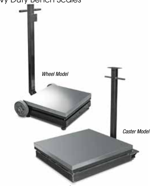
Ideal for Aviation Weighing. A complete system can be sold with the Tracer® AV. Reference Aviation section for specifications.