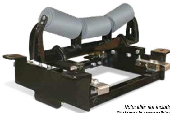
Note: Idler not included. Customer is responsible for mounting idler to weigh frame.

Guidelines assume clean belt with automatic tensioning system. Accuracy guidelines are typical. System accuracy may vary depending on environmental influences.